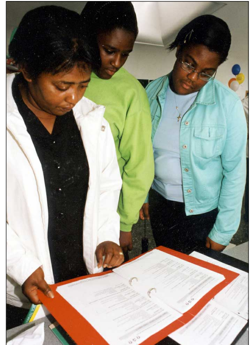
■ CONSIDERING their next move.

Generally the comments received supported