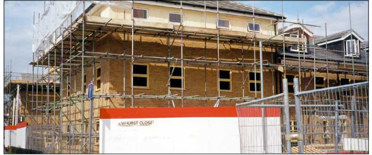
■ NEW housing association homes take shape in Stepney.

We will report further in a future issue on the priority of the successful applicants and the number of other people who have also been rehoused as a result of the vacancies created.